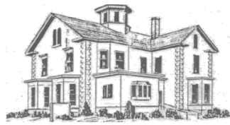
Hudson Senior Center

Town Of Hudson Council on Aging Multi-Service Center 29 Church St. Hudson, MA