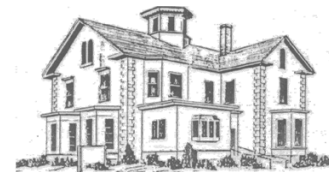
Hudson Senior Center

Town Of Hudson Council on Aging Multi-Service Center 29 Church St. Hudson, MA